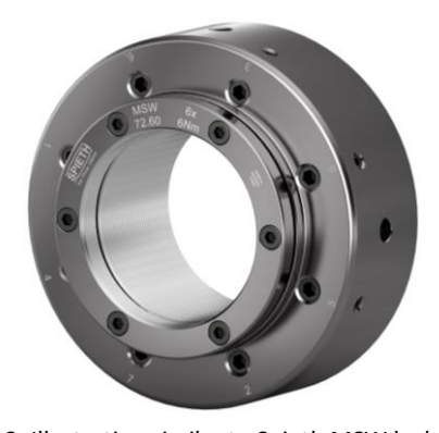
Fig. 2: Illustration similar to Spieth MSW locknuts

Despite their compact design and the high axial loads occurring here, Spieth-locknuts guarantee permanent pretension and a rigid and precisely aligned contact with the bearing for an immaculately supported spindle.