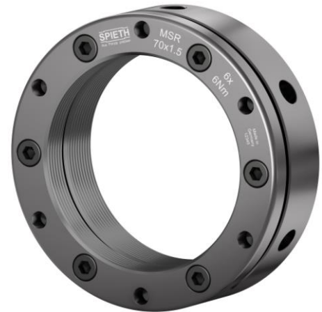
Fig. 2: Illustration similar to Spieth MSR locknuts

Despite their compact design and the high axial loads occurring here, Spieth-locknuts guarantee permanent pretension and a rigid and precisely aligned contact with the bearing for an immaculately supported spindle.