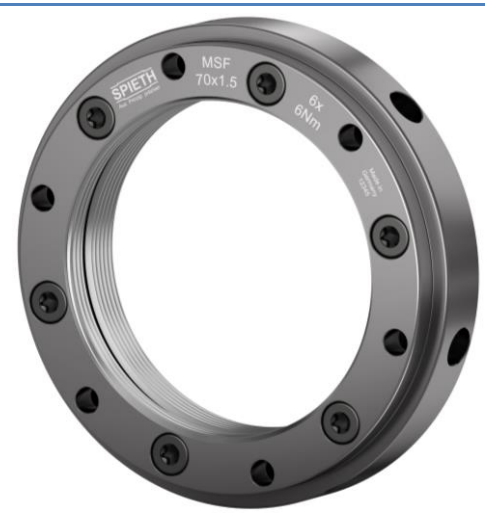
Fig. 2: Illustration similar to Spieth MSF locknuts

Despite their compact design and the high axial loads occurring here, Spieth-locknuts guarantee permanent pretension and a rigid and precisely aligned contact with the bearing for an immaculately supported spindle.