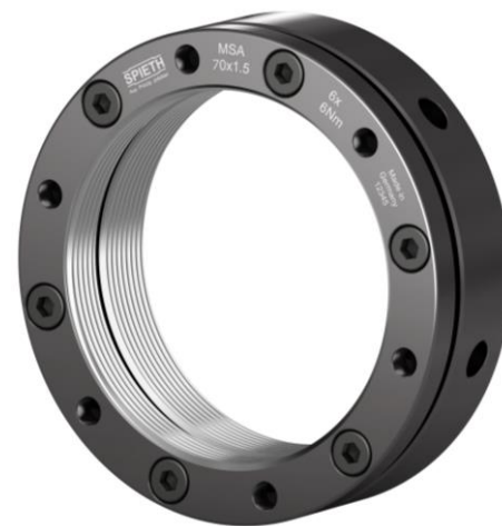
Fig. 2: Illustration similar to Spieth MSA locknuts

Despite their compact design and the high axial loads occurring here, Spieth-locknuts guarantee permanent pretension and a rigid and precisely aligned contact with the bearing for an immaculately supported spindle.