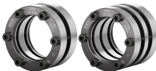
Fig. 2: Illustration similar to Spieth DSK/DSL clamping sets

Despite their compact design they can ensure continuous load transmission and rigid connections together with precise, centering and optimum concentricity for applications with high torques and axial forces.